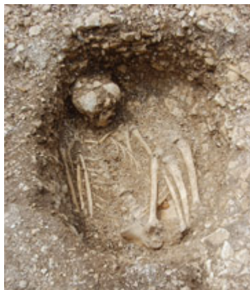
Excavations at Down Farm

The last 30 years has also seen an increase in new methods and scales of investigation ranging from geophysics, landscape scale surveys including aerial survey, and systematic recording of historic buildings. The interest of archaeologists has also expanded to include evidence from modern periods linked with a much wider definition of the historic environment and heritage conservation. For example, the study, conservation and management of historic parks and gardens now fall firmly within the archaeologist's agenda.