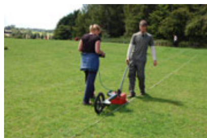
Community Archaeology Project at Damerham

Within the AONB there are many societies and groups ranging from village historical societies to Women's Institutes groups, with an active interest in the archaeology and history of the area. Many of these host guest speakers and go on fieldtrips but do not currently engage in fieldwork or research as a group, although of course individual members may be undertaking research.