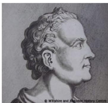
William Stukeley