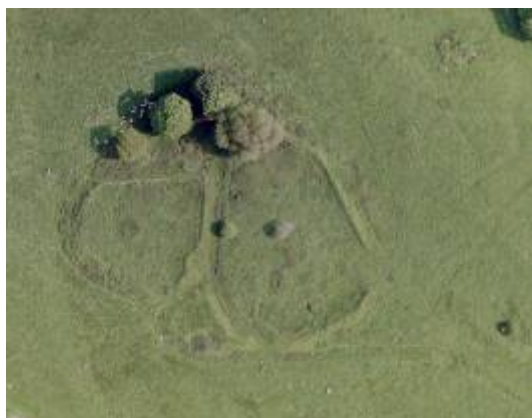
Earthworks at the Iron Age settlement at Woodcutts

These have revealed a pattern of different settlement types (enclosed, unenclosed), and sizes (single and multiple dwelling), with the classic pattern of round house associated with ancillary dwellings. The settlements are set within large scale field systems. However although many of the well preserved field systems on the Chalkland are Iron Age in date it can not be assumed all are.