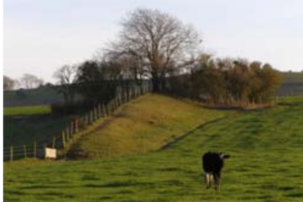
Neolithic Long Barrow on Bokerley Down.

The Neolithic period in the AONB is marked by the first origins of farming and the introduction of domesticated animals and plants. The most striking features from this period are the great ceremonial monuments which were constructed throughout the AONB. These include the great Dorset Cursus, the longest of its kind in the country, where parallel ditches and banks cross part of the region for a distance of over 10 kilometres. It is likely that this monumental earthwork became a focus for seasonal ceremonial gatherings both during and long after its