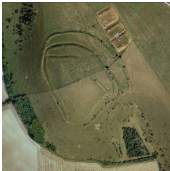
Iron Age Hillfort on Whitesheet Hill seen from the air

The Early Iron Age dates from 700BC to 400BC . The most visually recognisable and iconic features from this period are the Hillforts. There are twenty-one Iron Age hillforts in the AONB often positioned in prominent positions for example Winklbury Camp is located on the edge of the chalk escarpment. At least one of the hillforts within the AONB on Whitesheet Hill follows a common pattern as it is associated with an earlier Neolithic Causewayed Enclosure. None of the hillforts in the AONB has seen systematic archaeological investigation, although both the hillforts of Hod Hill and Hambledon Hill located just outside the western boundary of the AONB have been the subject of more detailed survey.