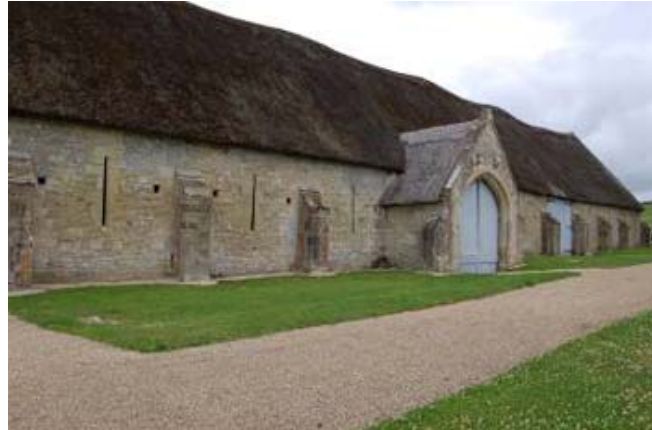
Medieval tithe barn, Tisbury

The Late Medieval period traditionally begins with the conquest of England by a French speaking Norman elite, over the English speaking elite, based in castles and manor houses. The medieval landscape of the AONB was characterised by a pattern of nucleated villages, with associated manor surrounded by open fields. The church and nobility were the major landowners and political force and the area was dominated by the establishment of Royal Hunting Forests (Selwood and Grovely) and Hunting Chases (Cranborne) which were governed by special laws that impacted on all aspects of the landscapes management.