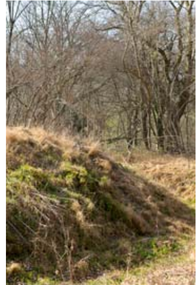
Bronze Age barrow in woodland

The Bronze Age of the AONB is marked by the beginnings of metal working in Copper, Gold and Bronze. The early Bronze Age also sees the introduction of new burial practices with single inhumations placed beneath mounds of earth called Round Barrows often associated with grave goods including metal objects. The Bronze Age in the AONB is also characterised by a shift to sedentism (permanent living in one location) marked by large scale cultivation and clearly defined settlements. By the Middle Bronze Age the landscape of the AONB was defined and bounded by extensive field systems.