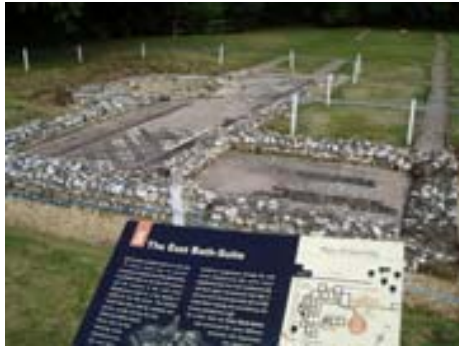
Rockbourne Roman Villa