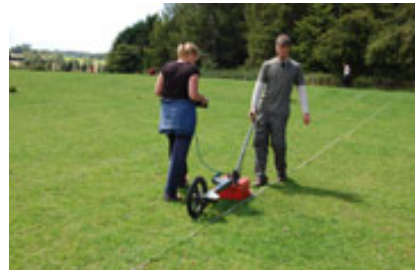
Community Archaeology Project at Damerham

Within the AONB there are many societies and groups ranging from village historical societies to Women's Institutes groups, with an active interest in the archaeology and history of the area. Many of these host guest speakers and go on fieldtrips but do not currently engage in fieldwork or research as a group, although of course individual members may be undertaking research.