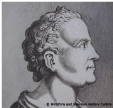
William Stukeley

“Wardour Castle, the seate of the Lord Arundell, was kept by Col Ludlow: a part of it was blown up by Sir F. Dodington in 1644 or 1645. Here was a red-deer parke and a fallow-deer parke.” John Aubrey (first published 1847)