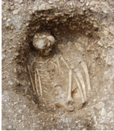
Excavations at Down Farm

The last 30 years has also seen an increase in new methods and scales of investigation ranging from geophysics, landscape scale surveys including aerial survey, and systematic recording of historic buildings. The interest of archaeologists has also expanded to include evidence from modern periods linked with a much wider definition of the historic environment and heritage conservation. For example, the study, conservation and management of historic parks and gardens now fall firmly within the archaeologist's agenda.