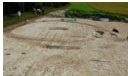
Excavations at Down Farm